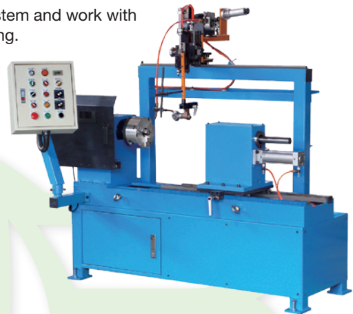
CMH-800 單槍 TIG (附送料系統)