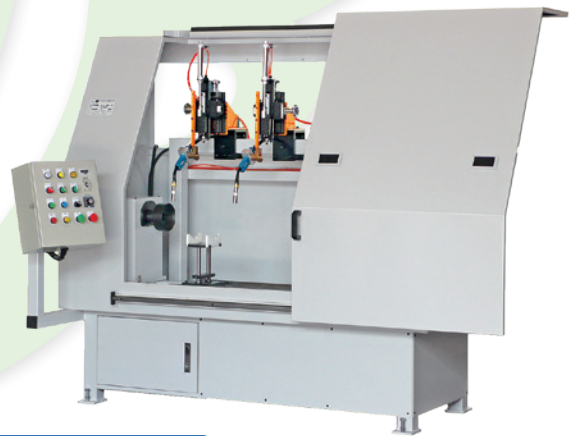
CMH-800 雙槍 (遮罩型)