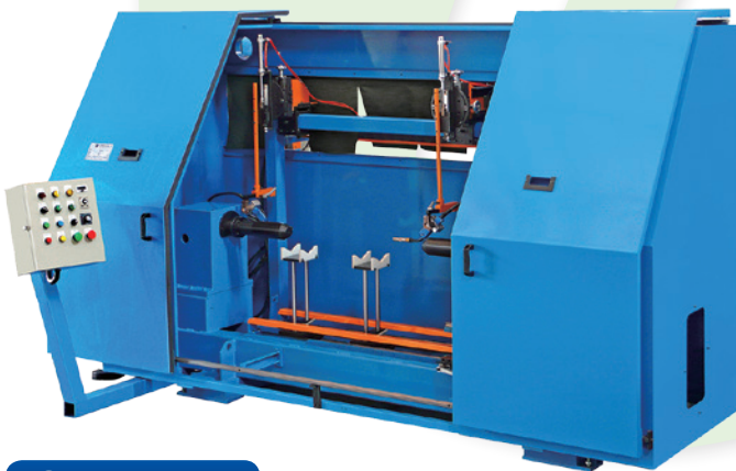
CMH-1600 雙槍 (遮罩型)