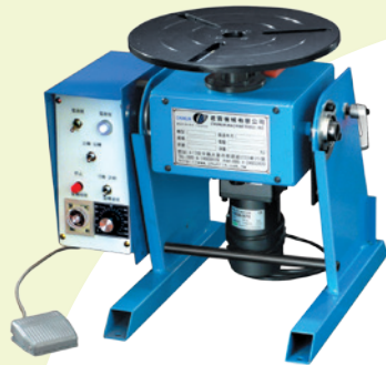
CMS-75 Max. load 最大荷重: 75kg