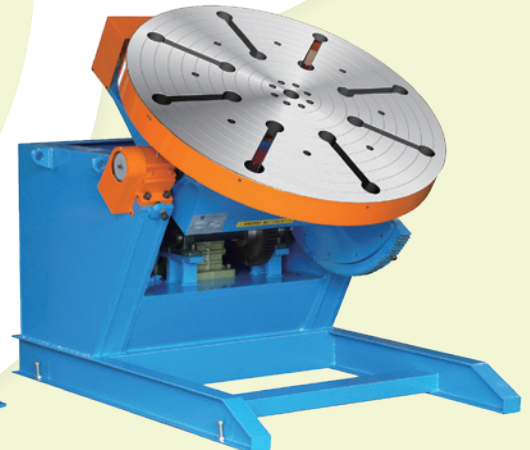
CMS-3000 Max. load 最大荷重: 3000kg