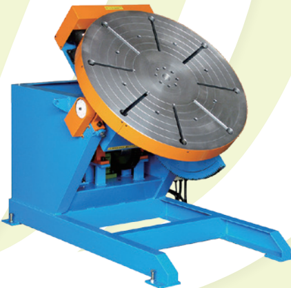
CMS-1000 Max. load 最大荷重: 1000kg