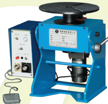
CMS-150 Max. load 最大荷重: 150kg