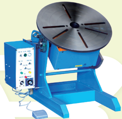
CMS-300 Max. load 最大荷重: 300kg