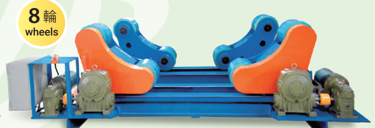
CMSA-50TC Max. load 最大荷重: 50T