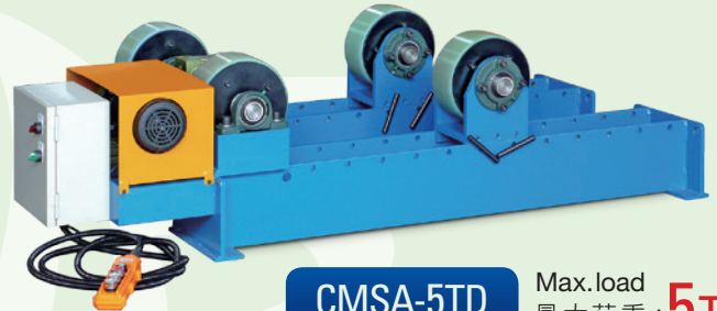
CMSA-5TD Max. load 最大荷重: 5T