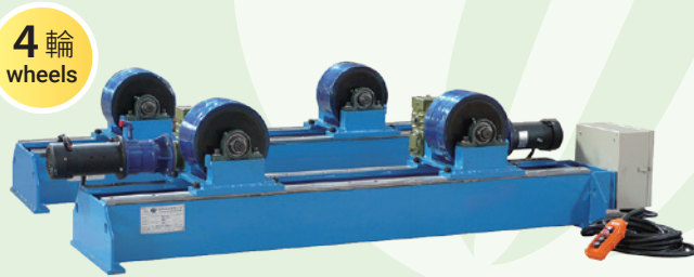
CMSA-10TA Max. load 最大荷重: 10T