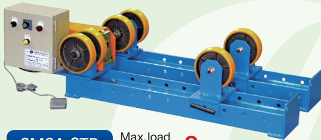
CMSA-3TD Max. load 最大荷重: 3T